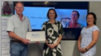
PMF = PROMPT Maternity Foundation

PMF are pleased to announce that we are collaborating with the Pacific Society for Reproductive Health (PSRH) to support the adaptation and localisation of the new PROMPT Global training resources for use within their unique geographical area. PSRH is a non-governmental organisation which encourages the professional development of reproductive and neonatal health care workers across the diverse geography, economy and population of Pacific Island countries.